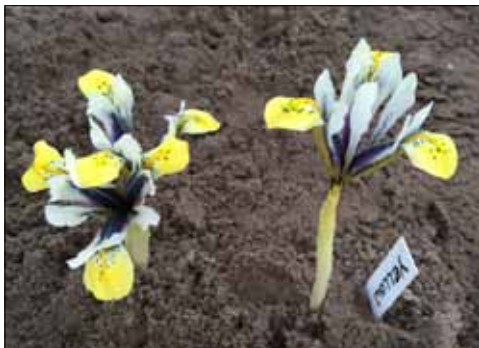
Yellow Eye Catcher