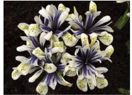
'Eye Catcher' with Multiple Flower Parts

A previous Dutch grower of my 'Eye Catcher' had allowed 'Amazing' (00-KN-1) to be mixed in. In 2015 I spent about two days overall during the week I was there, going through the 150 m of 'Eye Catcher' and pulling out the 5-10% "contamination" and replanting it elsewhere. This year there was less than 1% and I was similarly looking over the bed (now 280 m) and taking out 'Amazing' and replanting them