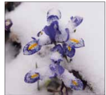
Fresh snow on blooming flowers

I have been paying a lab in Holland to covert some of my hybrids from diploids to tetraploids (going from two to four sets of chromosomes). One of the benefits is the flowers should be 20-30% larger, and the petals should correspondingly be thicker and stand up even better to the weather. Does this mean the flowers will similarly last a little longer? That's something I'm looking forward to studying once I have some in my garden. In Holland I have seen that tetraploid 'Orange Glow' flowers are indeed 25% larger.