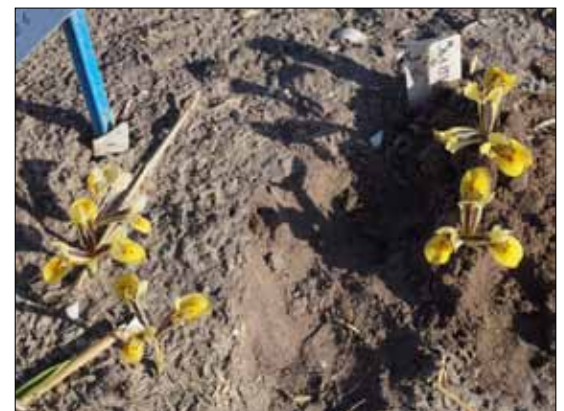
'Orange Glow' (left: diploid; right: tetraploid)

I have been paying a lab in Holland to covert some of my hybrids from diploids to tetraploids (going from two to four sets of chromosomes). One of the benefits is the flowers should be 20-30% larger, and the petals should correspondingly be thicker and stand up even better to the weather. Does this mean the flowers will similarly last a little longer? That's something I'm looking forward to studying once I have some in my garden. In Holland I have seen that tetraploid 'Orange Glow' flowers are indeed 25% larger.