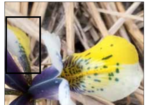
Eye Catcher with Yellow Fall