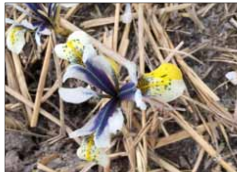
Eye Catcher in Straw