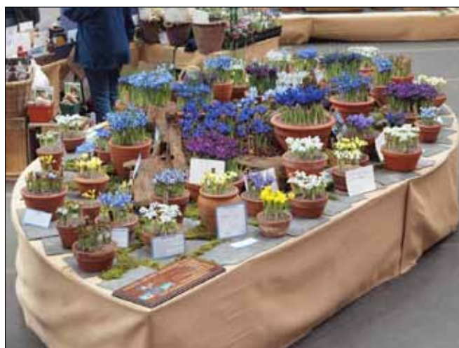
Jacques Amand Stand at RHS show