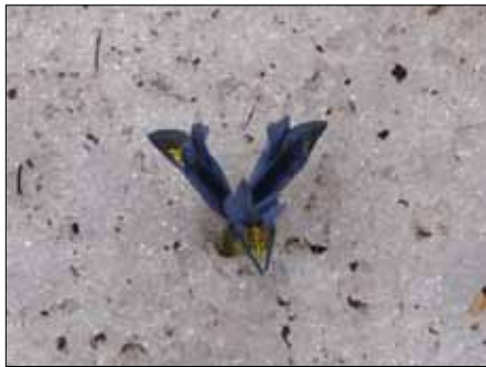
Retics coming up through Winter snow

The thing I particularly like about Reticulata Irises is they are one of the first plants to bloom each year. Here in Toronto, they bloom right as the snow is disappearing—perfect for helping get rid of the Winter blahs. Some years they seem to come up right through the snow. Individual flowers last three to seven days (sometimes longer), depending on the temperature. Overall, the bloom season is three weeks in length, but can be longer if mild conditions allow for an early start to Spring. Occasionally we get a snowfall while they are in bloom, and they stand up fairly well to this; picking themselves up so-to-speak as the snow melts (I don't have photos of them fully recovered because at that point I'm more interested in what's new).